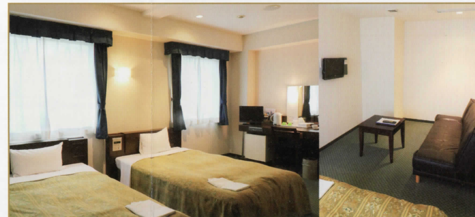
ツインルーム タイプB Twin Room B