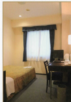
シングルルーム Single Room

Our warm hospitality offers guests comfortable and relaxing time away from the bustle of everyday life.